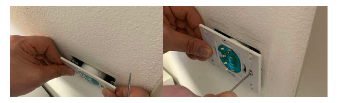
[5] Check all KNX functions before to install front panel.