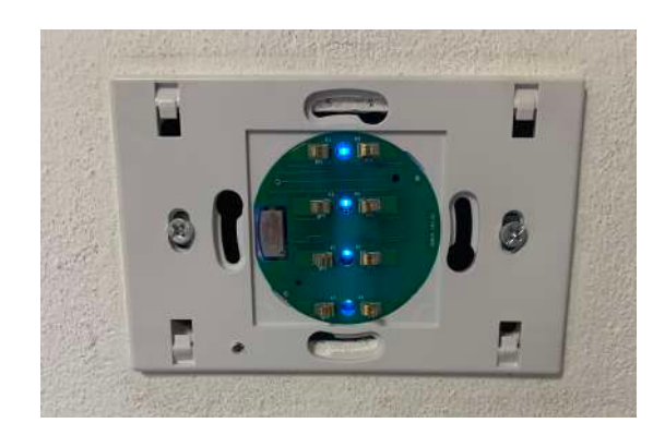
If KNX works well without front panel it means that hardware is OK.